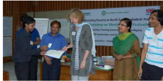
DEW ED at M & E workshop of APONE project