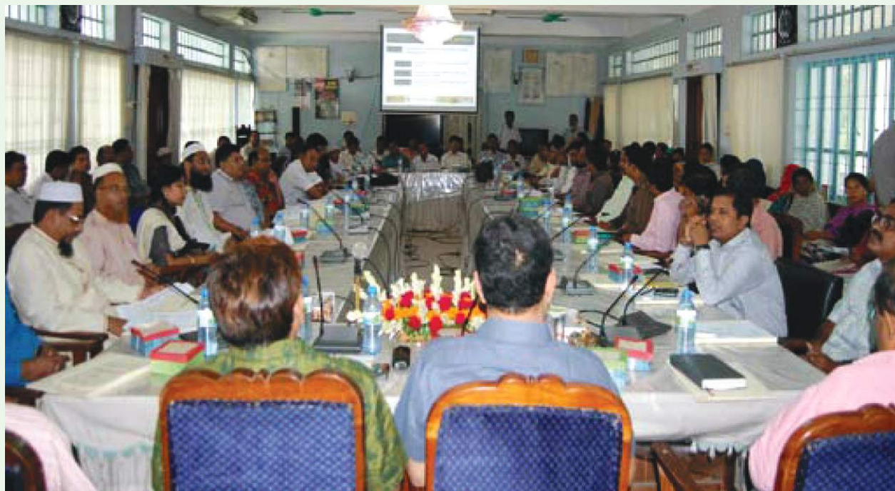
District Commissioner of Sherpur and Mymensingh, Executive Director of DEW attended at APONE project promotion workshop