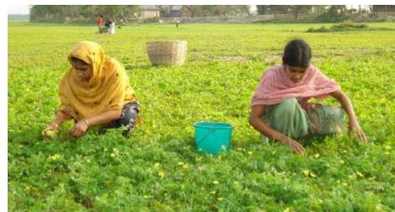
Farmers are collecting vegetables from their field