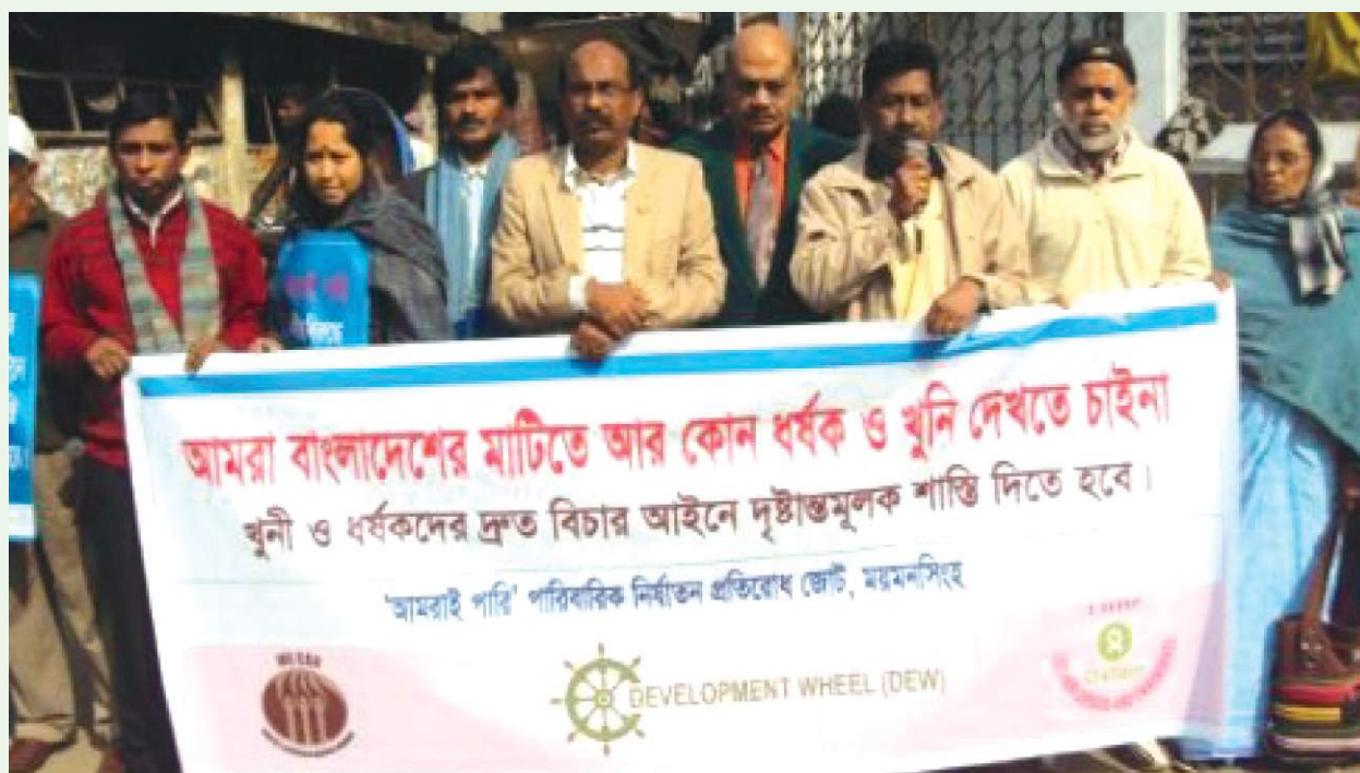
Human chain to protest against recent incidence rape & killing at Shahid Feroz Jahangir Chatter, Mymensingh