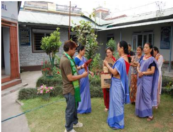
Awarded by Women Development Organization Nepal