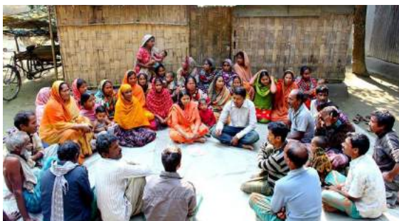
Group meeting with the farmer groups