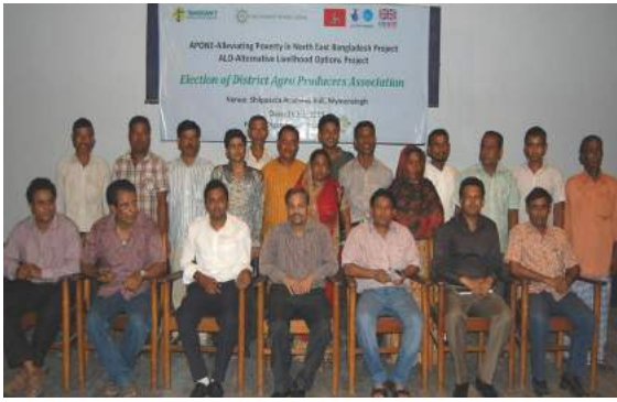
DEW fomed agro producer association