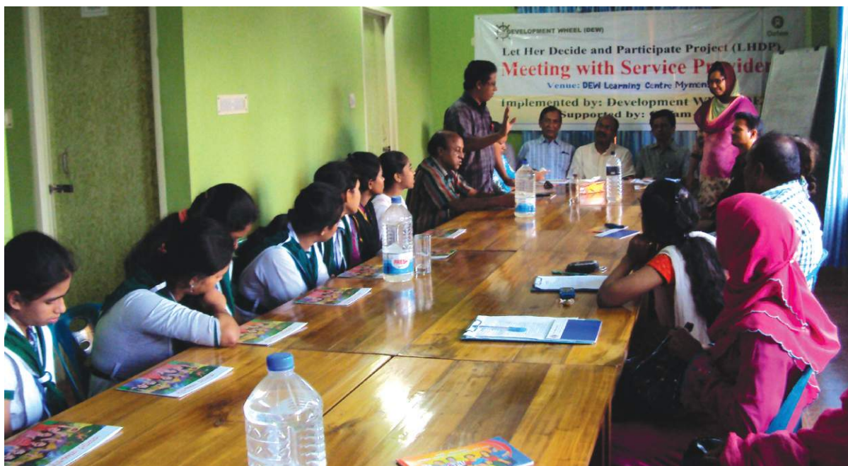
Meeting with service providers