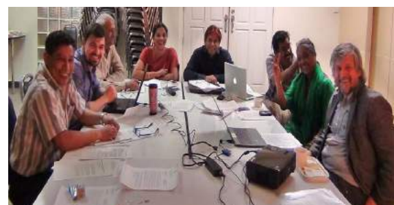
WFTO Asia Board Meeting at Bangkok, Thailand