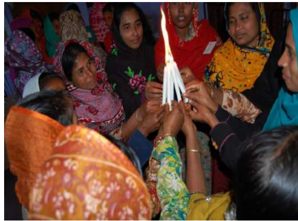
Together WE CAN make difference