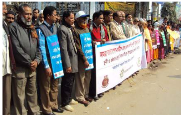
Human Chain protesting rape & VAW