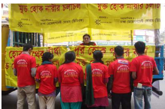
16 Days of Activism against Gender Violence

upholding a culture of human rights and good governance . . . . .