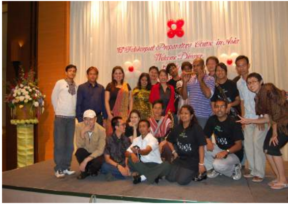
Fk-Norway meeting at Bangkok, Thailand