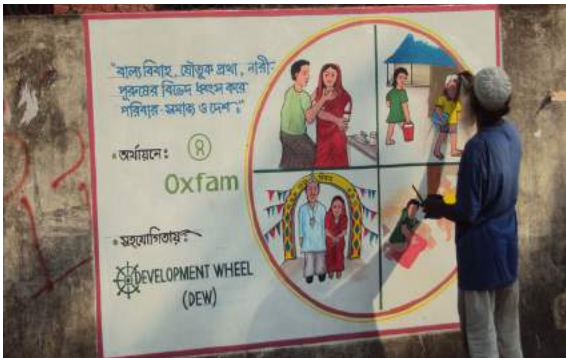
WE CAN campaign wall painting at Mymensingh