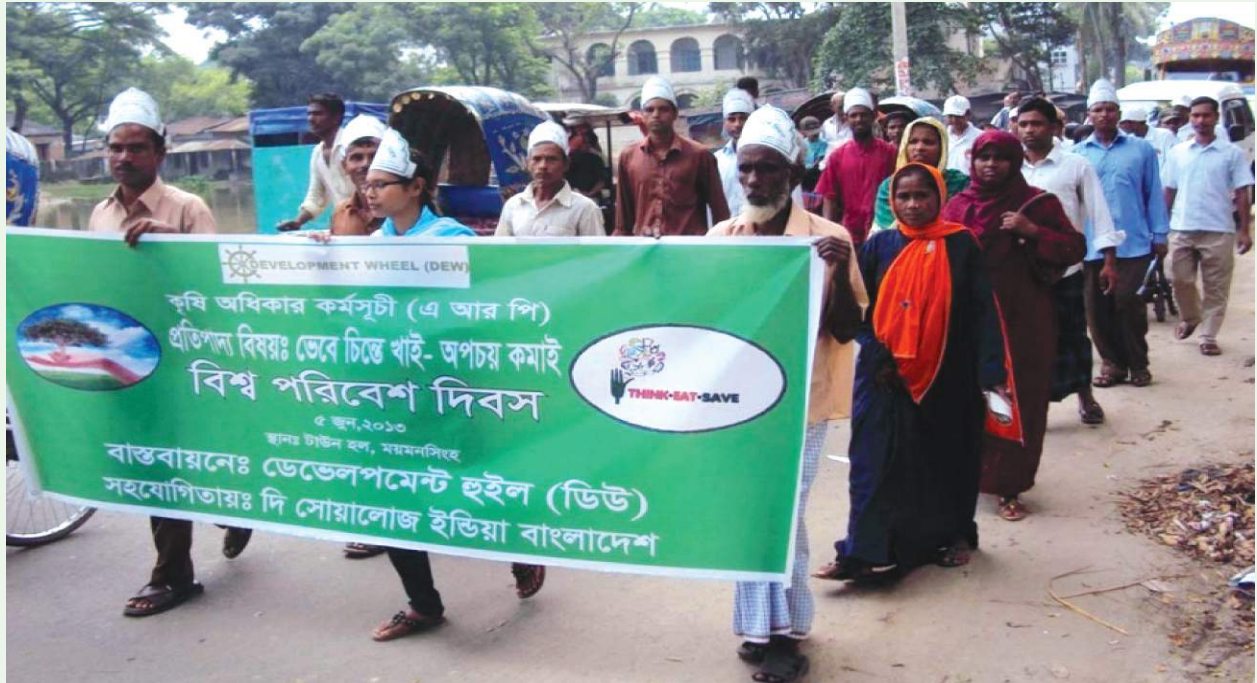
DEW celebrates World Environment Day 2013 with the farmers of the Agricultural Rights Program (ARP).