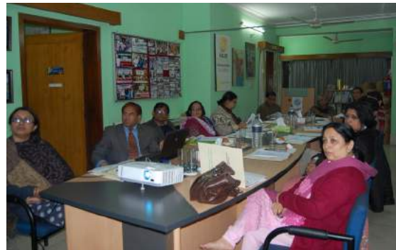
16 th Annual General Meeting-AGM of Development Wheel