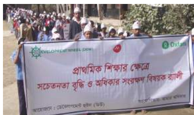
DEW is campaigning to ensuring quality primary education