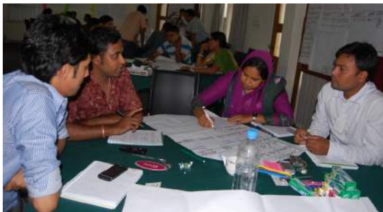
DEW has been organized several trainings for human resource development of the organization and its partners