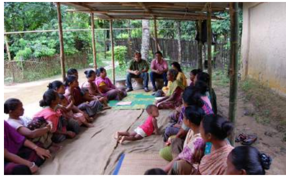
Ethnic minority group of DEW in Mymensingh