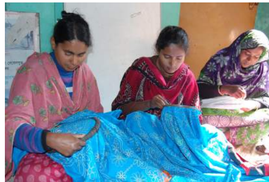
Hand embroidery groups are working at DEW