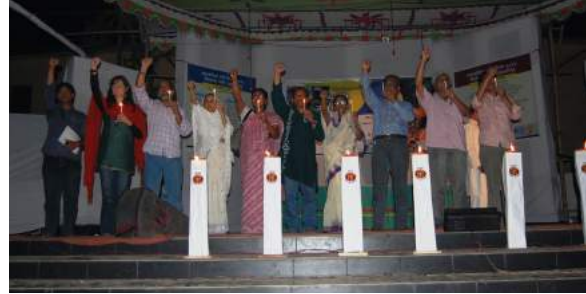
DEW observing International Women's day at Mymensingh