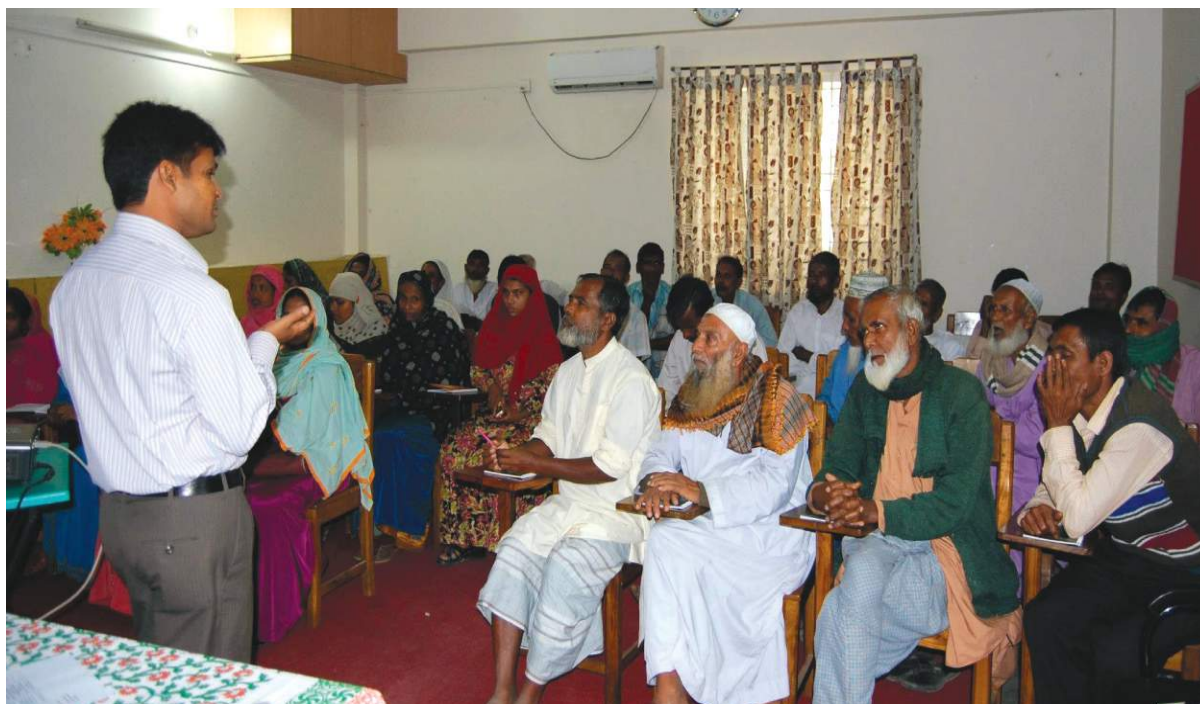
Upazilla agricultural officer discussed on improved cultivation technique to farmers