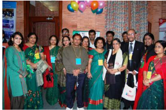
We Can culmination seminar at Nepal