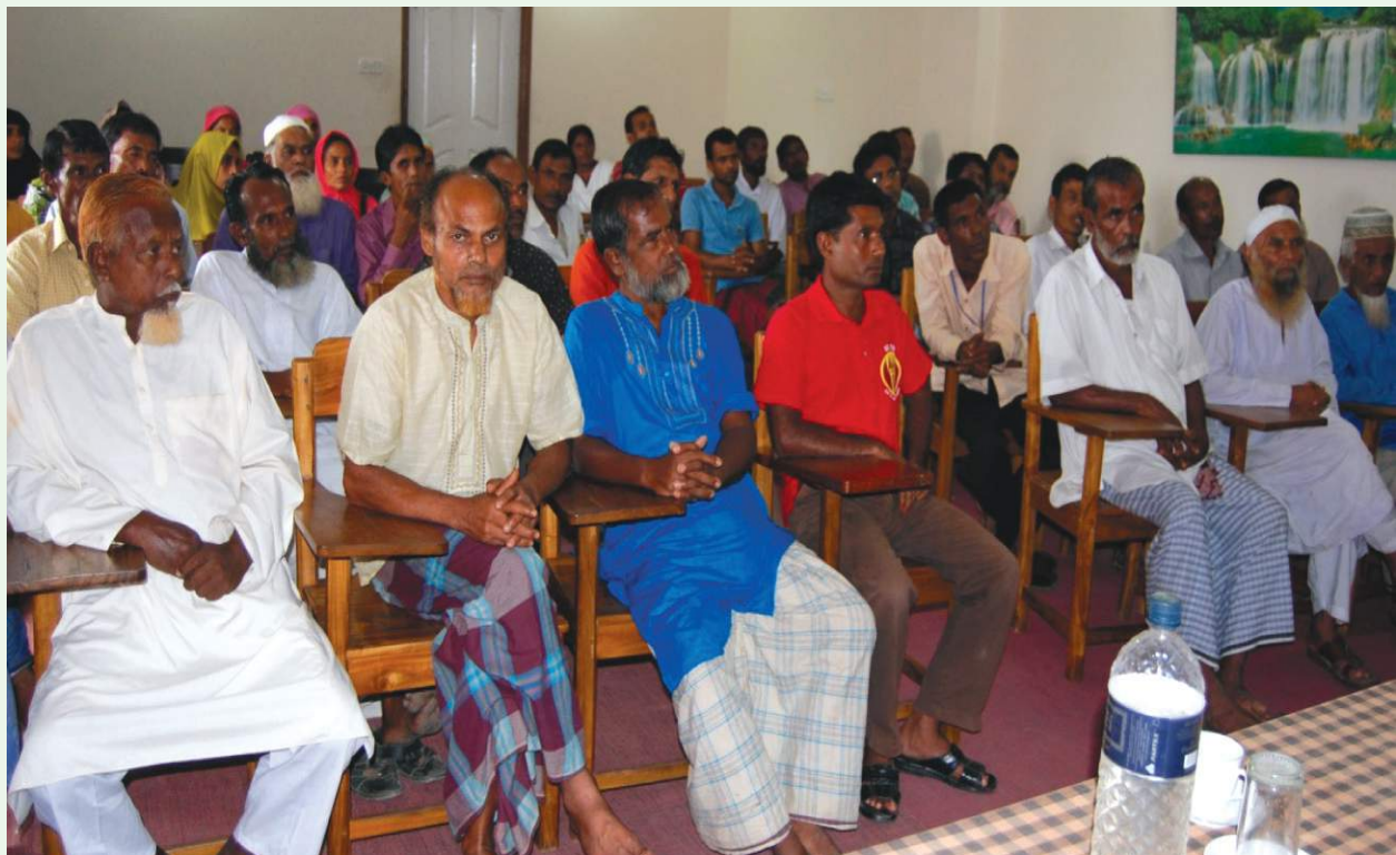
Executive Director of DEW addressing the workshop participants