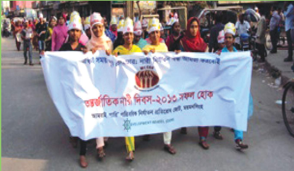
DEW observed International Women's Day

The theme of this International women's day'08 March, 2013 was "A promise is a promise: Time for action to end violence against women". Development Wheel (DEW) celebrated this day in collaboration with other right based NGOs in Mymensingh.