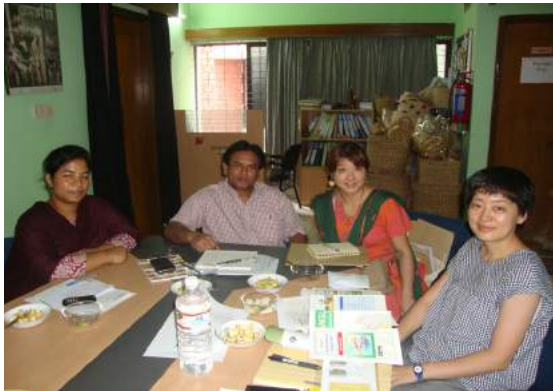
People Tree delegate are working at DEW