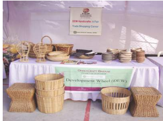
DEW participated in different Fair trade craft fairs