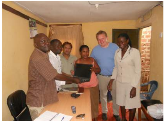
Uganda for a feasibility study on Transforming Lives