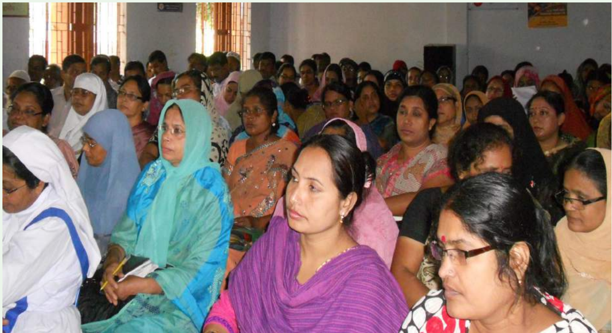
Dew organized a seminar on World Teachers' Day 2012