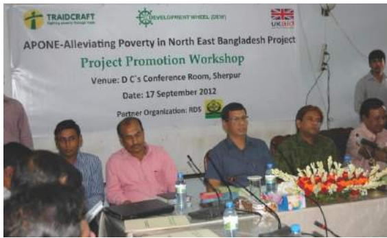
Deputy Commissioner, Sherpur and other Officers in APONE project promotion workshop at Sherpur