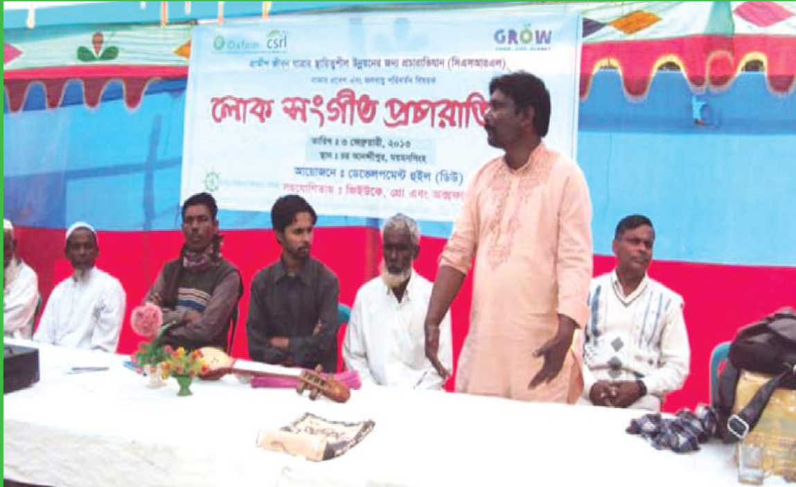
Baul group singing songs on access to market and climate change as a part of folk song campaign: Participants of folk song campaign program with Baul group