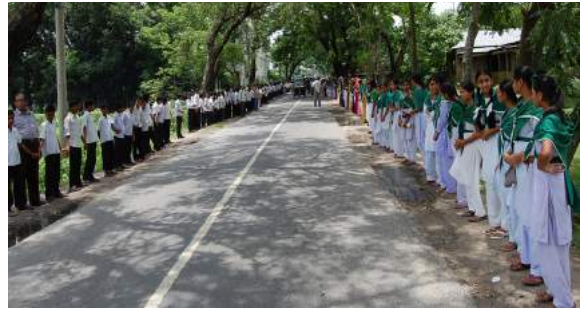
Demonstration against eve teasing