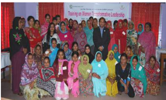
DEW upholds women leadership