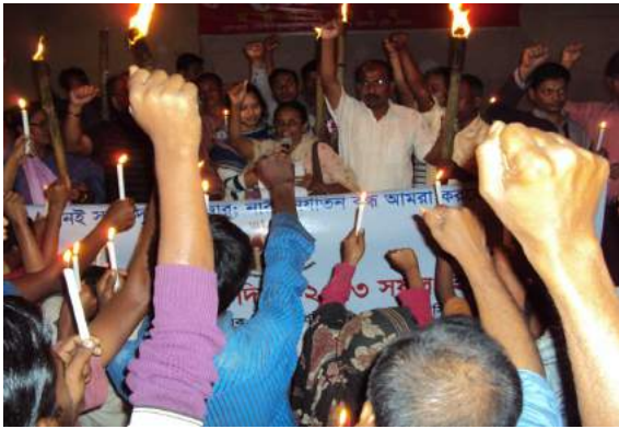
DEW Celebrated International women day-2013