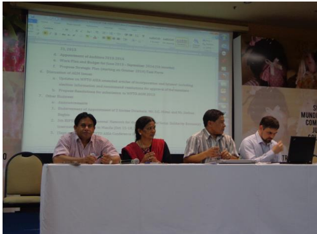
WFTO Asia Board meeting and AGM at Rio, Brazil