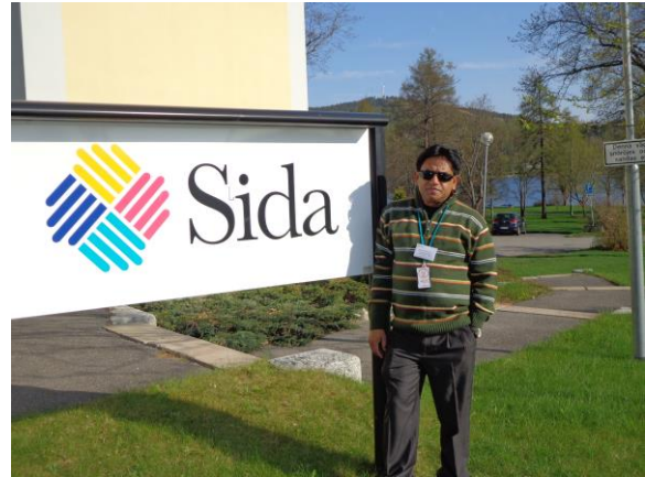
Sida workshop at Harnasand, Sweden