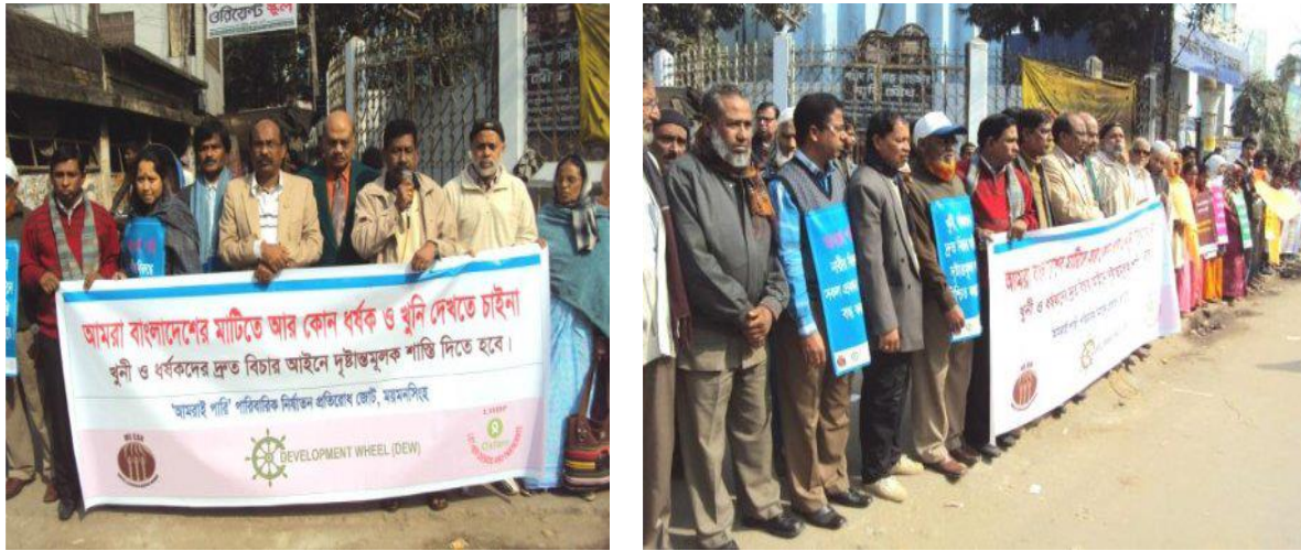
Human chain to protest against recent incidence rape & killing at Shahid Feroz Jahangir Chatter, Mymensingh