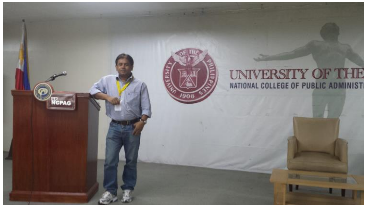
Presentation at University of the Philippines