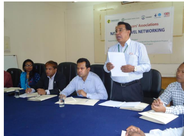
National level networking workshop for producer associations at Dhaka