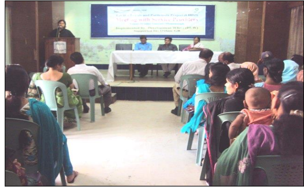
Meeting with the service providers