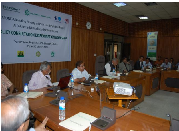
National Agriculture Policy consultation and dissemination workshop at IDB bhavan