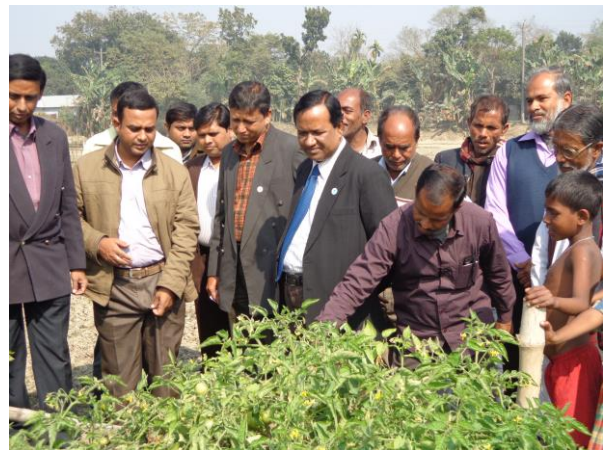
Demonstration plotes in Haluagha