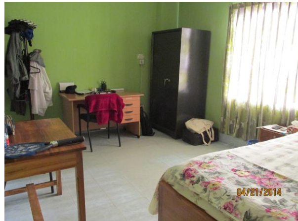
DEW guest rooms at Mymensingh