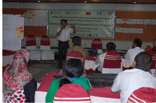
Workshop on Enhance Excellence in Professional Service Provision