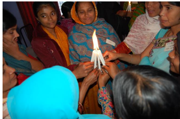
Participants in the women transformative leadership Training and group work session