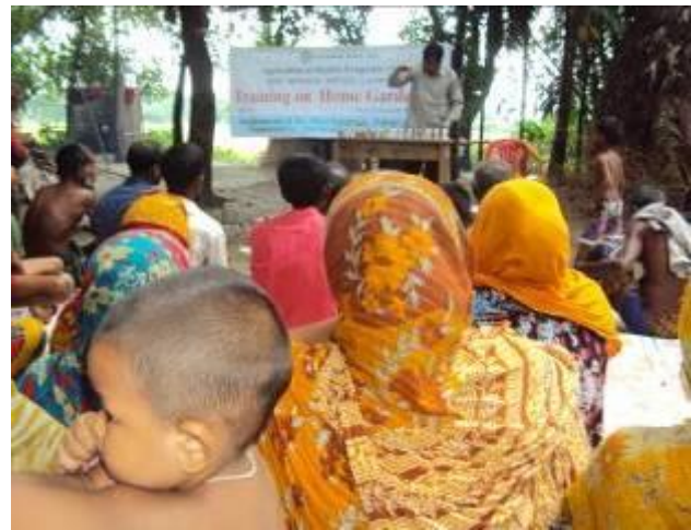
Home gardening training session by SAAO