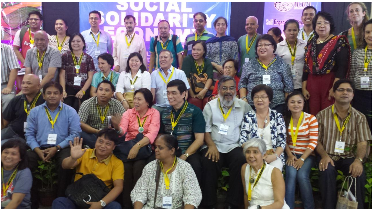
With the leaders of Solidarity Economy