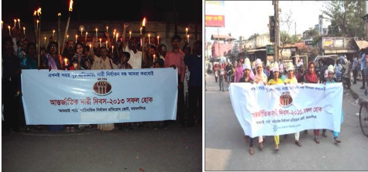
International Women's Day observation

The theme of this International women's day'08 March, 2014 was "A promise is a promise: Time for action to end violence against women". Development Wheel (DEW) celebrated this day in collaboration with other right based NGOs in Mymensingh.