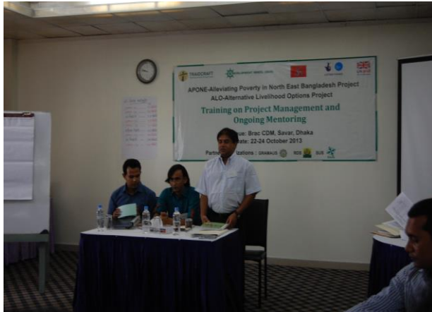
Project management training for project staffs of ALO project at brac CDM, Savar