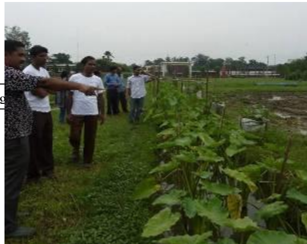
Farmer and staff are visiting regional sugercan institute at Gazipur