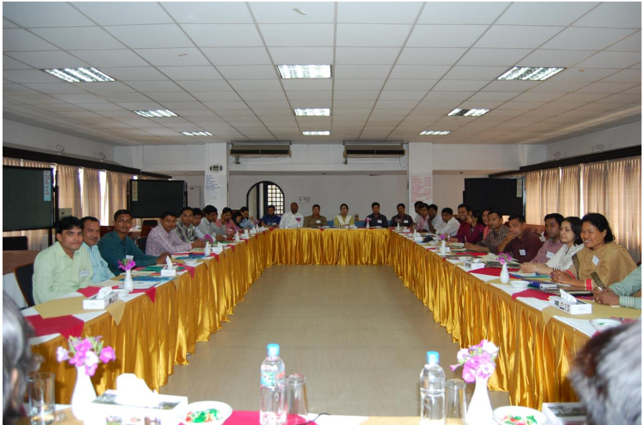
Business management and enterprise development training for DEW staffs at Brac CDM, Rajandrapur

The main objective of this project is to reduce poverty and ensure more sustainable livelihoods for poor and marginal communities in Mymensingh and Sherpur district through sustainable agricultural practices. The APONE project is working with 7200 small & marginal farmers of six upazilla under Mymensingh and Sherpur district. This project is funded by UKaid and co-funded by Traidcraft Exchange and implemented by Development wheel (DEW), Traidcraft Exchange and local partner organization GRAMAUS & RDS. Farmers of Mymensingh & Sherpur, Agricultural service providers, the representative of different public & private service providers were also delivered their speech on this project promotion workshop.