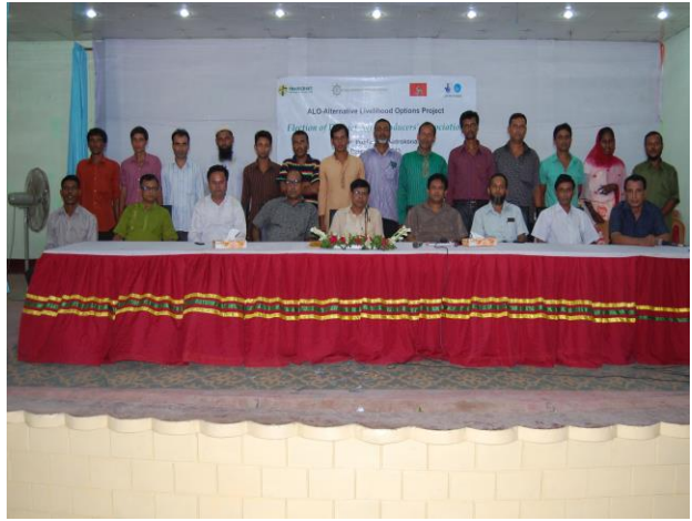
Election of Netrokona district agricultural producer association and elected office bearers