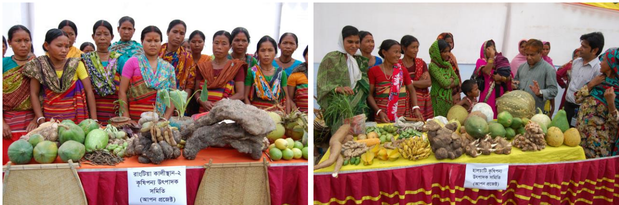
Agro Fair at Shepur

To access in the local market for selling the agro products of farmers, 26 agro fairs were organized at the union level of Phulpur, Haluaghat, Dhobaura, Sherpur Sadar, Nakla and Jhenaigati upazila in January and February 2014. Group farmers & crop traders, input sellers participated the agro fair. 26 workshops were held among the group farmers & crop traders, input sellers for selling the farmers products. Project Coordinator, Regional Field Coordinator, Field Coordinator conducted the agro fair.