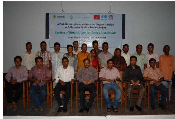
With voters and elected office bearers