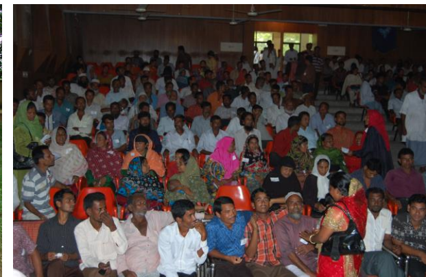
DAPA election at Sherpur, with elected office bearers