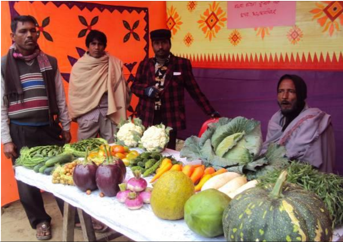
Farmers Association members displayed their organic vegetables in a stall of agro fair at Gouripur