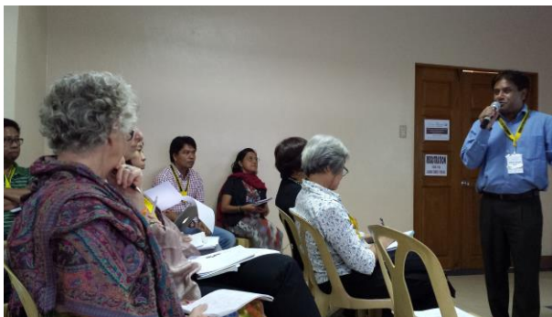
DEW presentation at Manila, Phillippines