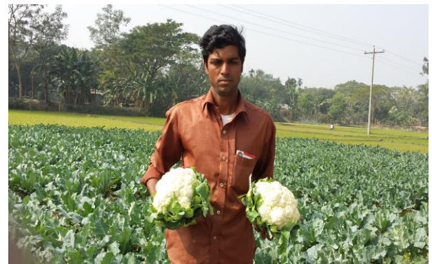
Organic vegetable produced by our Agriculture Rights Programme-ARP farmers at Gouripur, Mymensingh