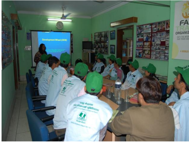
20 members Children Nepal delegation visited DEW