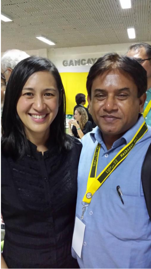
With deputy Mayor of Manila