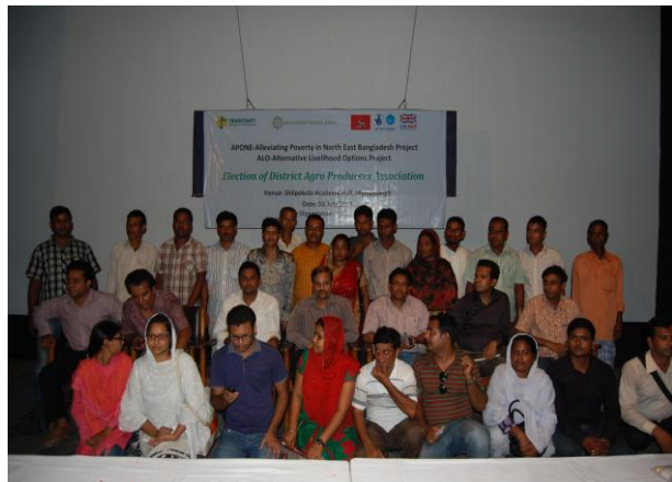
Election of Mymensingh district agro producer association and elected office bearers