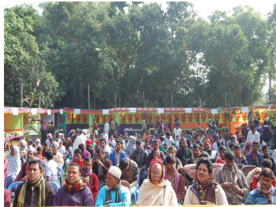
Field day observation and farmers conference