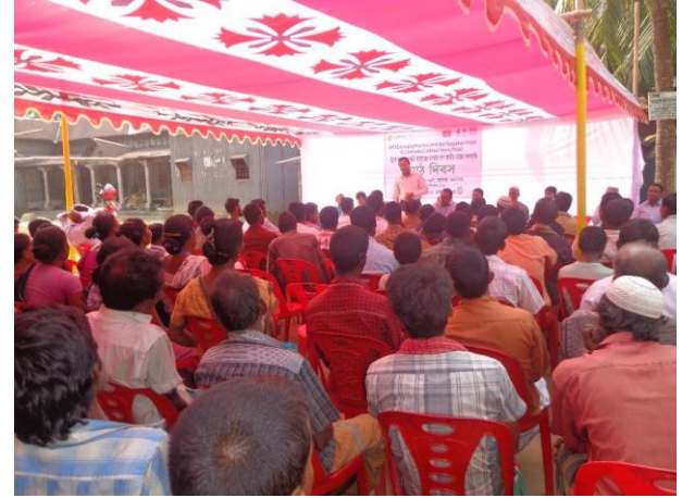
Field day observation