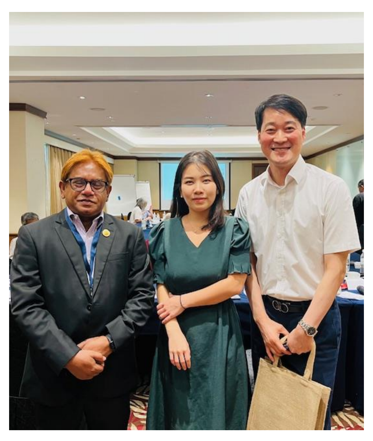
On 31st of January DEW Executive Director visited to the MySDG secretariat in Kuala Lumpur. Introduced all the staff members of the MySDG and they presented their activities which are promoting global goals 2030.

1st February DEW ED visited Bagan Seri field of the MySDG to see the FGD's with the fisherman communities in the coastal areas. MySDG staffs find out local problems through