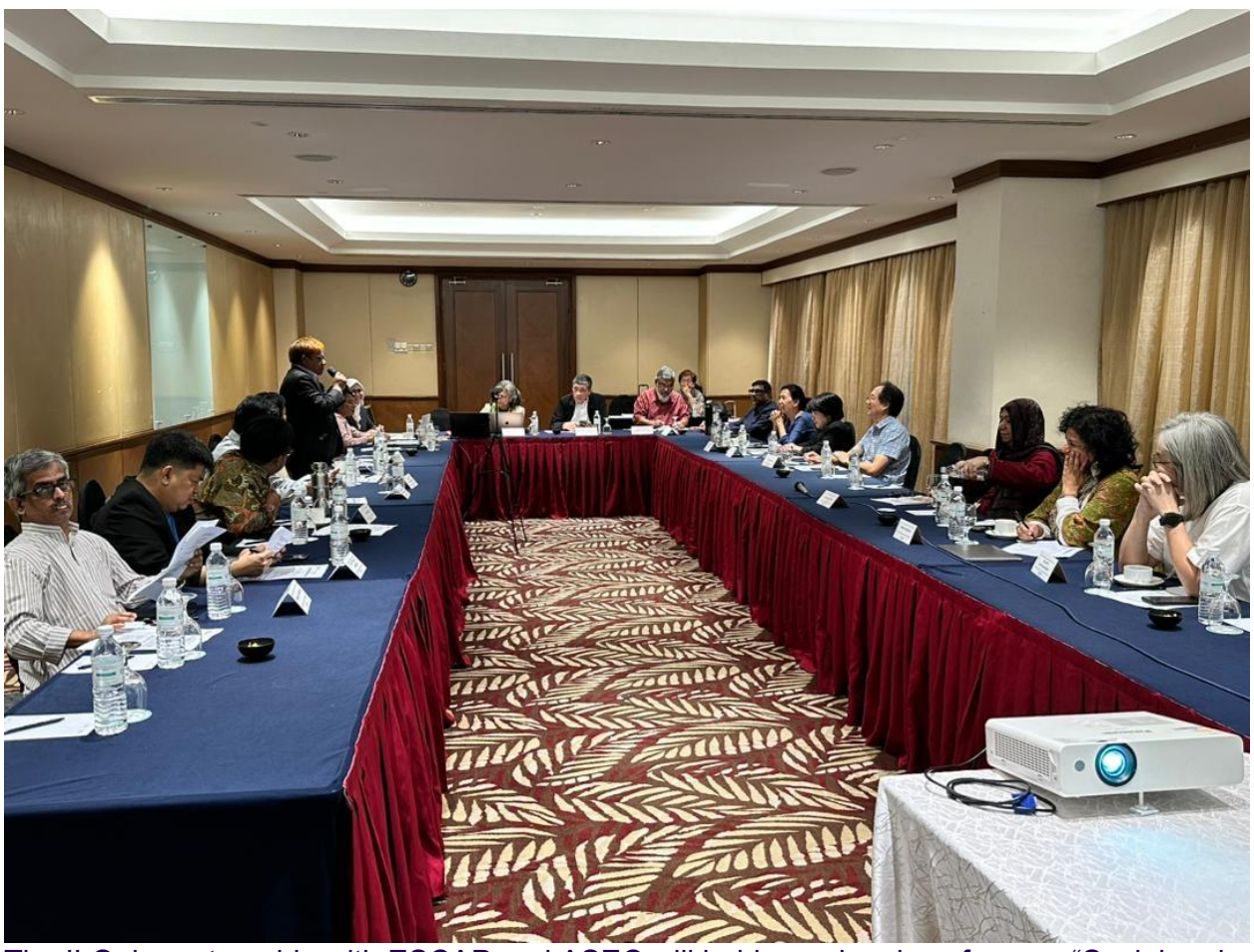
The ILO, in partnership with ESCAP and ASEC will hold a regional conference "Social and Solidarity Economy for Advancing the Sustainable Development Goals in Asia "in Bangkok, Thailand on 23-24 April 2024. ASEC will organize ASEAN Peoples' Forum, an annual forum of civil society organisations from ASEAN Member States as part of the ASEAN Summit in Malaysia in 2025.