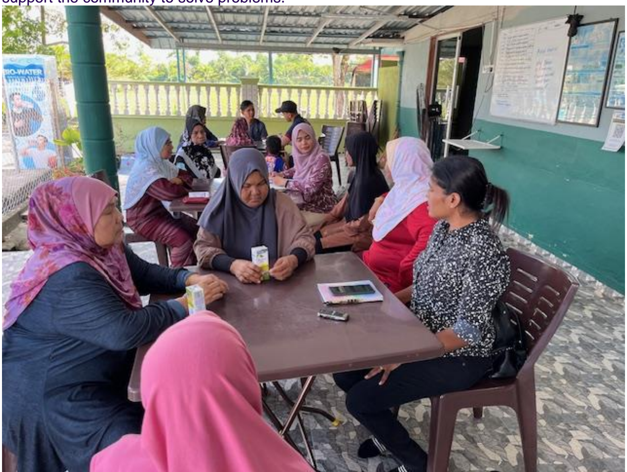
On 2<sup>nd</sup> February, DEW Executive director invited to present DEW activities at the secretariat of MySDG. It was a nice interactions and sharing with the participants.

support the community to solve problems.