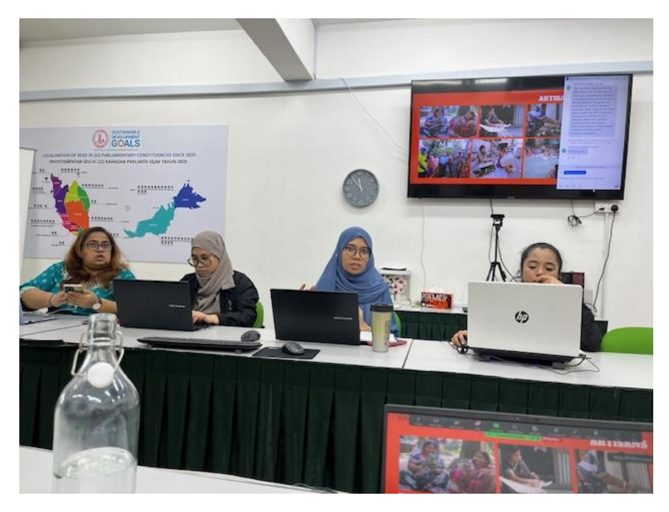
All-Parliamentary Group Malaysia was established by the Parliament of Malaysia in October 2019, an initiative driven to implement the SDGs in Parliamentary constituencies in Malaysia.